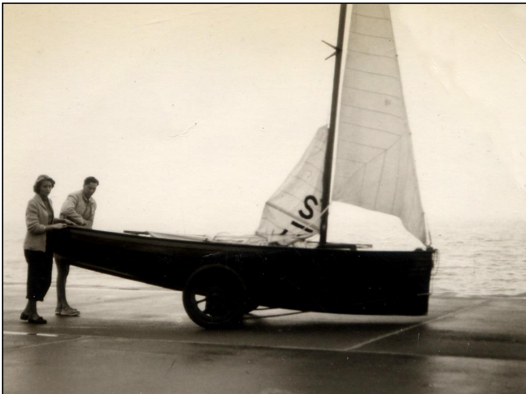
A 'Sturgeon' dinghy at Minnis Bay – 1950s, perhaps

Some members now travel as far as 300 miles to take part in races while cruising has almost disappeared apart from one or two in mid-season. The club retains its links with its past. Part of one of the original club boats – 'Boz' – is used as a trophy and is awarded for the most meritorious performance of the year.