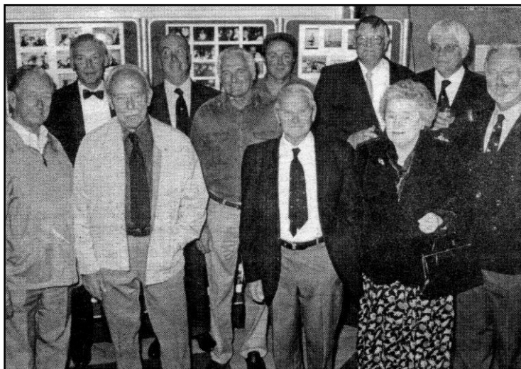
Members of the Club - 2000

The club's growth can be seen in the development of the various classes of craft. For the first few years, classes were unheard of. Our boats were generally converted fishing or rowing vessels or home-made designs.